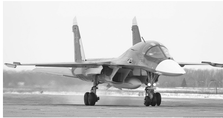
Figure 3. The Sukhoi Su-34 Fullback