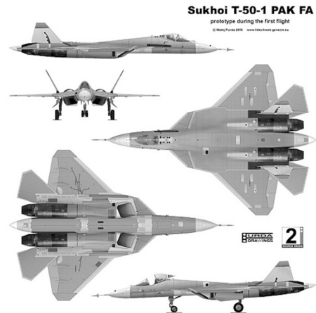
Figure 1. The Sukhoi PAK-FA (T-50) concept