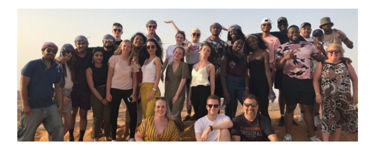
International Fieldtrips: Kuala Lumpur, Malaysia