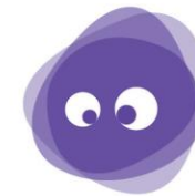
Jellybo Happiness manager