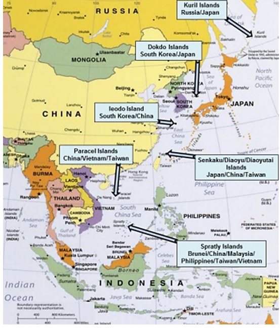
Fig. 1. Maritime disputes in the East Asia and Pacific

competitors for the leader's position on the global arena. US presence is of critical importance for Japan as for now as its military security is relying on the superpower's capabilities and support. A few smaller nations are similarly looking for any reliable option to enhance their security situation and some of them have been in other islands disputes with Beijing (Spratly and Paracel Islands - see fig. 1). The disputes must be treated in broader context, as China is afraid of vulnerability of its East Coast and wants to push a possible threat out of its shoreline. It is paralleled by threat of being contained by US as explained Henry Kissinger; he saw such the endangerment already during Mao era. He mentioned it in relation to a Chinese game 'go' or 'weigi'3 in which to win it is necessary to surround an opponent.