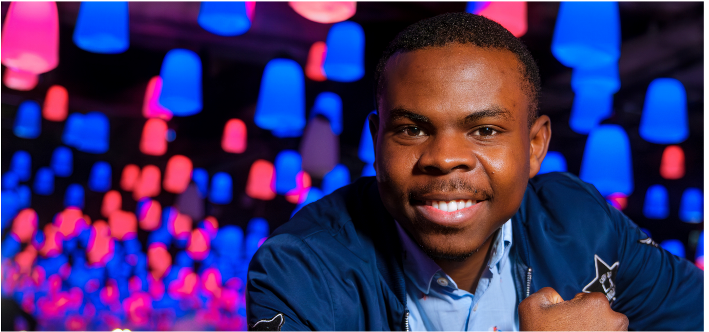
WSB University's International Student in Funzeum (Gliwice city).

Most cities have these three organised under one provider which makes the purchase of tickets far easier. In Silesia the responsible entity is ZTM. There are several offices situated all over the Metropoly with some of the main ones being: