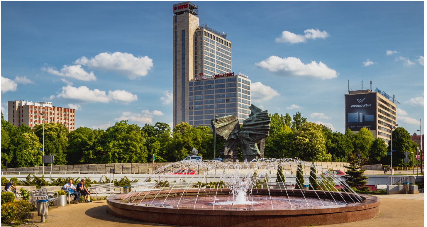
Fountain in the center of Katowice.

Katowice Street Art - The city boasts an impressive collection of street art and murals, with works by local and international artists adorning buildings throughout the city center.