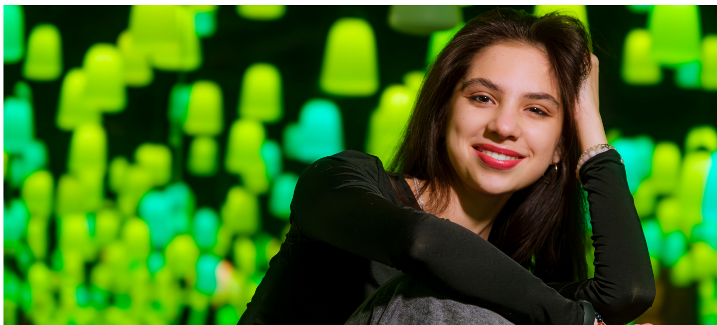
WSB University's International Student in Funzeum (Gliwice city).

While we understand many of our visitors are eligible for student discounts, please note that until you obtain a valid student ID, you won't be able to purchase tickets at the discounted rate. Purchasing a discounted ticket without a valid student ID could result in a fine, so please proceed with caution.