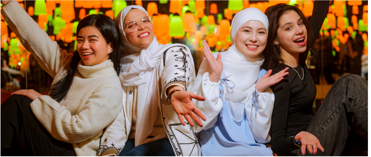
WSB University's International Students in Funzeum (Gliwice city).