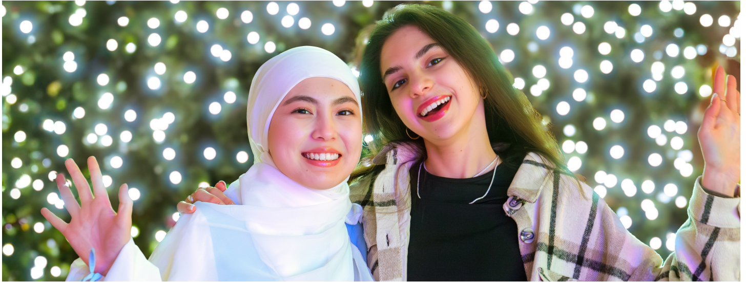
WSB University's International Students in Funzeum (Gliwice city).

It's important for all international arrivals to remember to keep their travel documents accessible at all times to ensure a smooth entry process during checks.