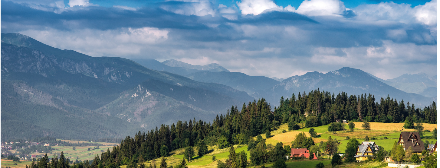
The view of the mountains in the city of Zakopane.

Auschwitz-Birkenau Camps, Oswiecim - Located near the industrial town of Oświęcim in southern Poland (in a portion of the country that was annexed by Germany at the beginning of World War II), Auschwitz is a death camp: a prison camp, an extermination camp, and a slave-labour camp. It is the most lethal of the Nazi extermination camps. A place where history is right in front of everyone eyes. A place which all human beings have to visit at least once in their lives. Official website - https://www.auschwitz.org/en/