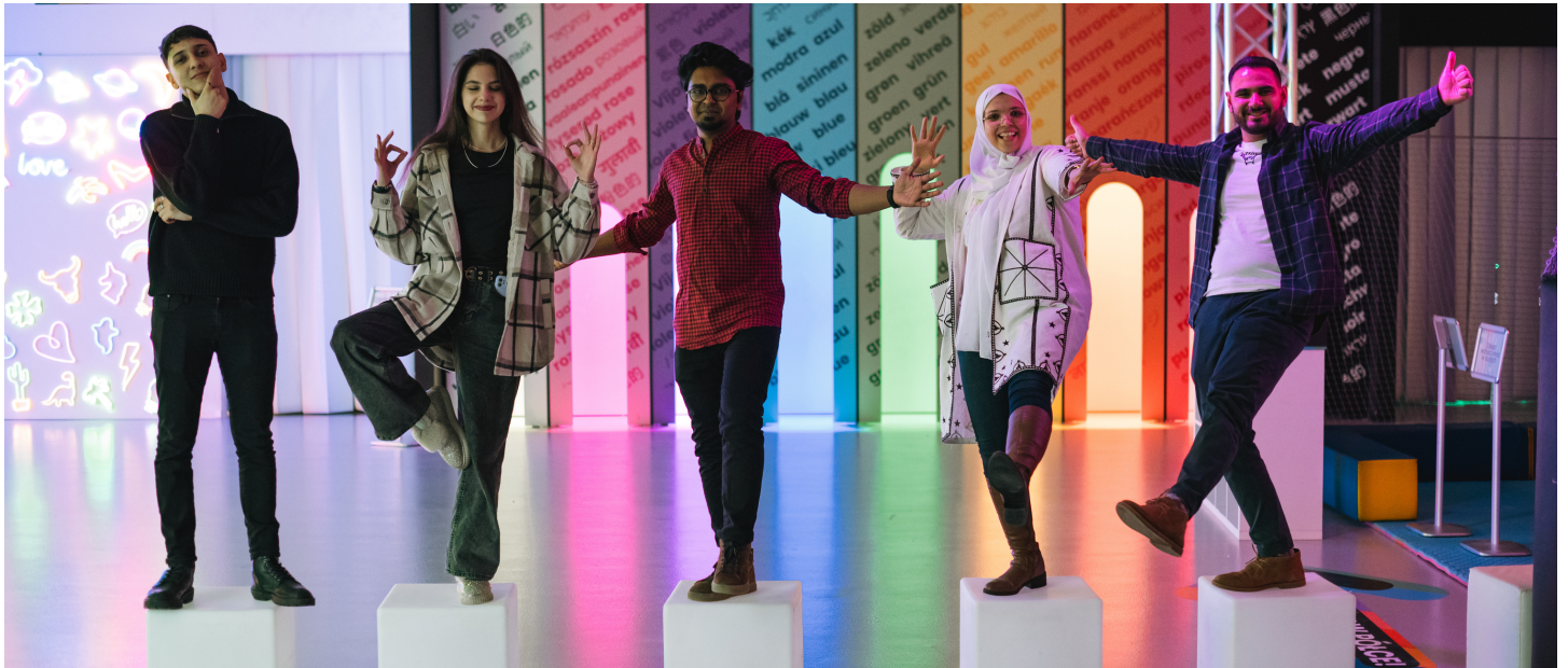
WSB University's International Students in Funzeum (Gliwice city).