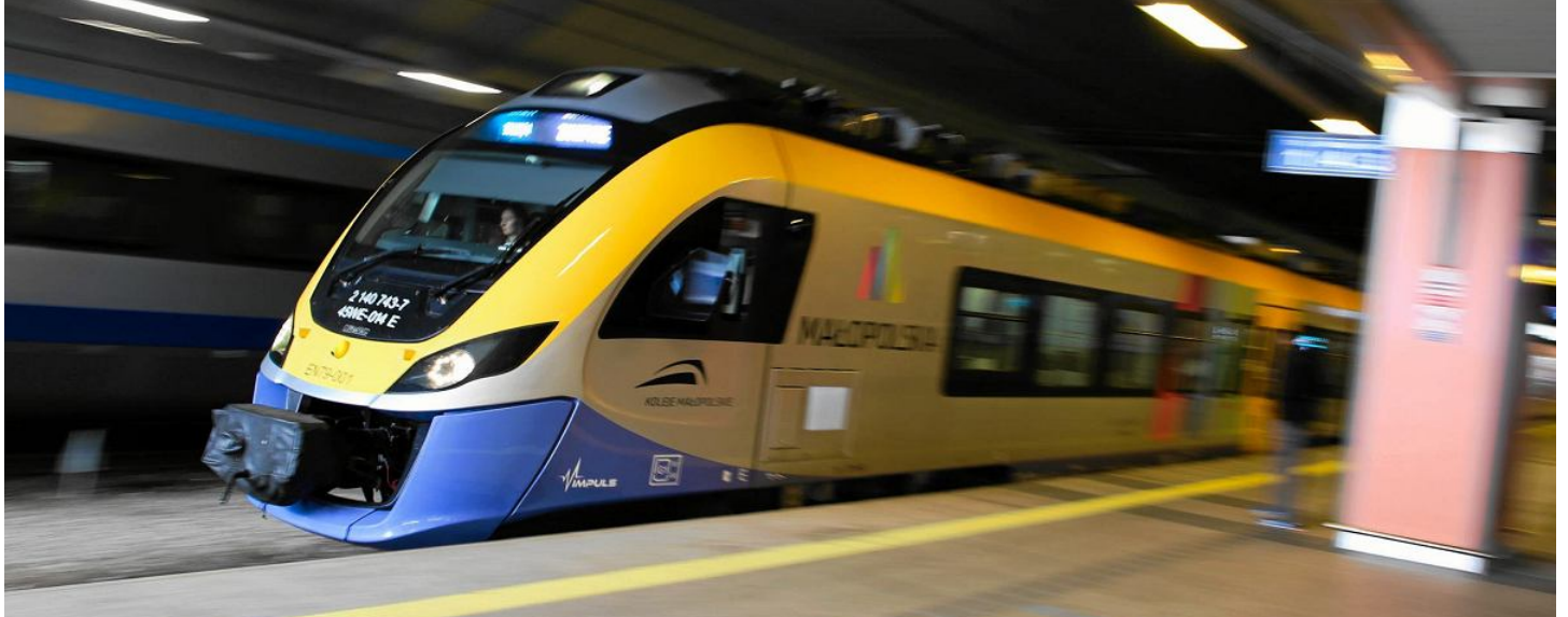
Train from Kraków Airport to Kraków Old Town.

Getting from the airport to the city center of Kraków is straightforward. A shuttle train service provides direct connectivity between John Paul II Kraków-Balice International Airport and Kraków's main railway station, Kraków Główny, located in the heart of the city. Additionally, bus services offer frequent links to various parts of Kraków, including the city center.