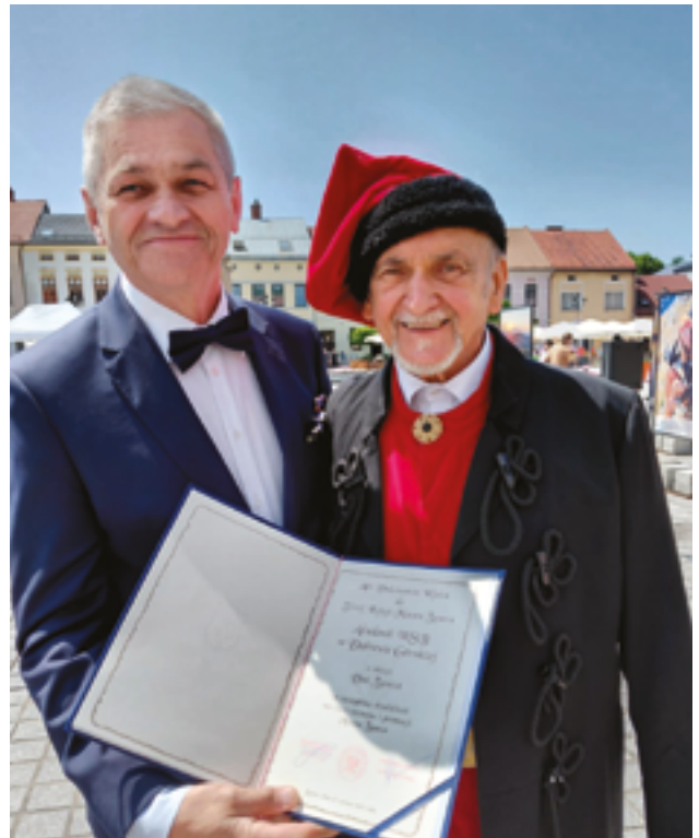
Antoni Szlagor, Mayor of Żywiec

The Golden Book includes individuals and institutions distinguished for promoting, developing, and defending the good name of the city of Żywiec. Each entry is made only once and represents the highest local honorary distinction.