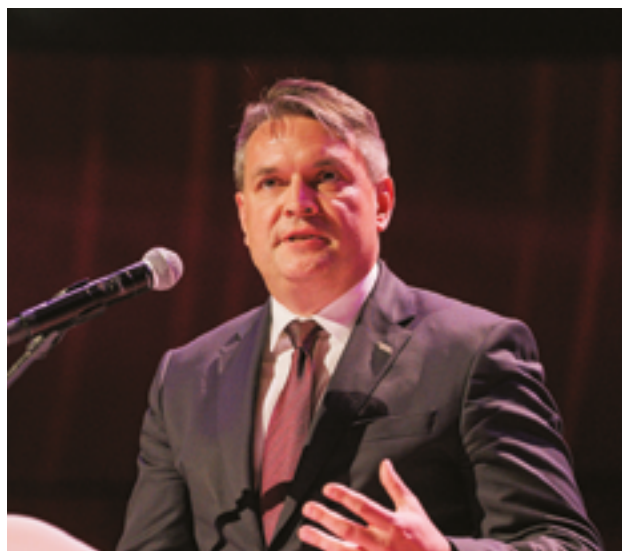
Marcin Bazylak Mayor of Dąbrowa Górnicza