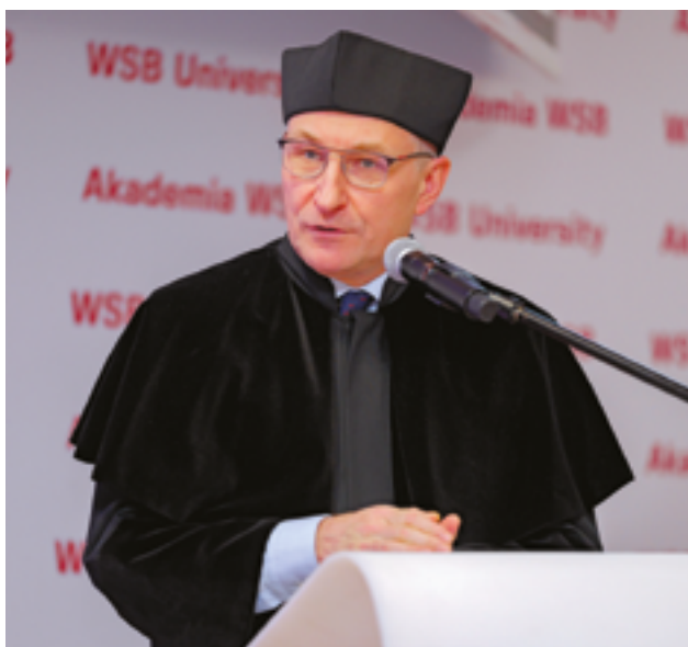
Prof. Maciej Szpunar, First Advocate General of the Court of Justice of the European Union

Minister of Science and Higher Education Republic of Poland