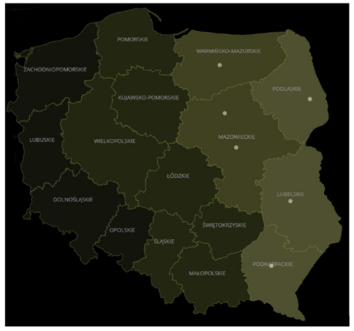
Fig. 1. Territorial Defence Wax Development Plans